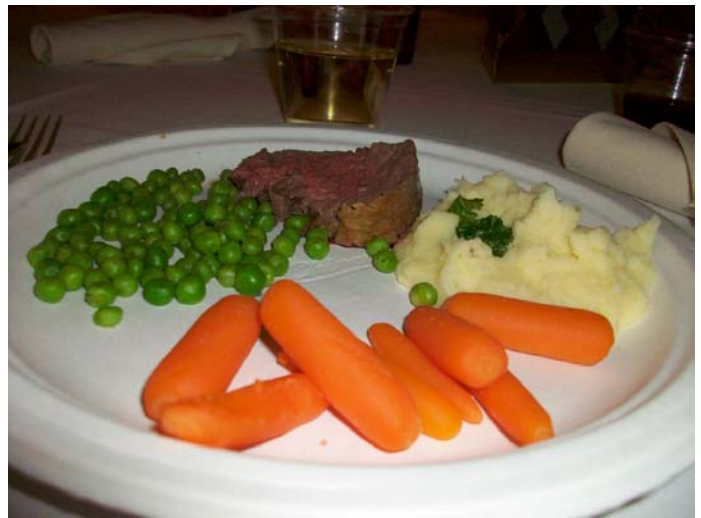
A lovely and delicious dinner was served by the Men of St. Barnabas.....