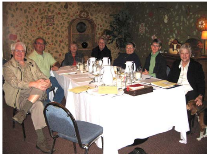
OUR VESTRY IN ACTION!